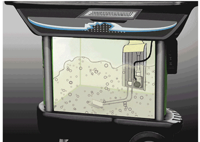
Surfactant in Ozzyjuice® solution emulsify the oils.