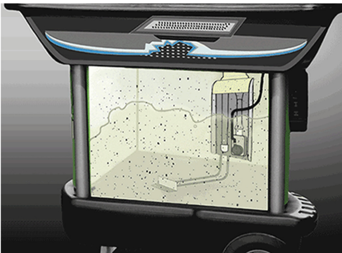
Oil contaminants enter the solution as parts are washed.

Bioremediation is the use of microbes to break down and “eat” oil, grease, and carbon-based contaminants. This proven biotechnology is used to assist in the clean-up of wastewater treatment ponds and lagoons in petroleum refineries and industrial manufacturing facilities all around the world.